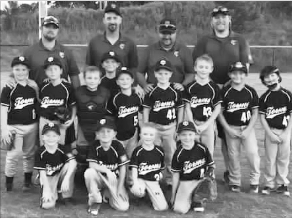
Towns County 8U Baseball