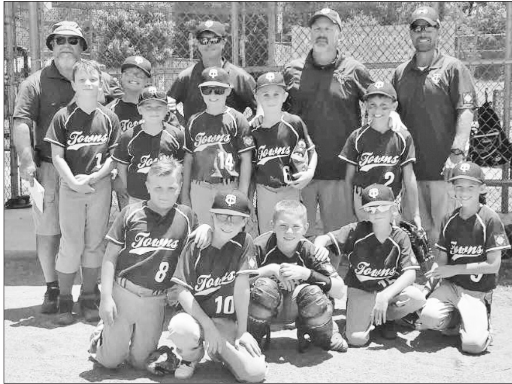
Towns County 10U Baseball