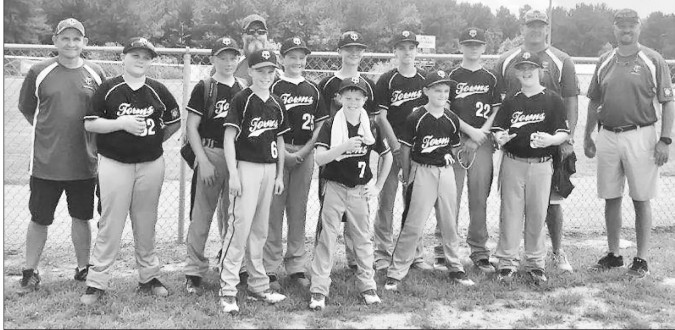
Towns County 12U Baseball

Towns remained perfect throughout the tournament en route to a District 6 Championship while also securing a spot in the State Tournament that will be held in Boynton.